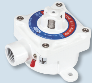
DETECTOR : SHT-4700D